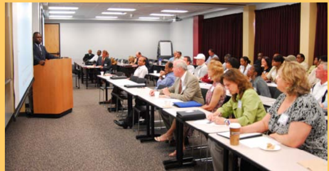
ARRA Outreach Meetings —Business owners from across North Carolina gathered at numerous NCDOT-BOWD ARRA stimulus outreach meetings to learn how to access opportunities created by the funding.