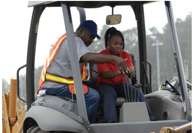
An OJT student learns to operate heavy equipment.

Since 2001, more than 28,000 students have participated in CCD events across the state. Students participate in various hands-on activities such as welding, carpentry, brick laying and electrical exercises. They also get the opportunity to operate heavy equipment such as cranes, motor graders, backhoes and loaders. Students have an excellent opportunity to talk with industry personnel about rewarding careers and salary opportunities in the commercial and highway construction industry. The next Construction Career Days event is scheduled for Fall 2009 in Greenville, NC.