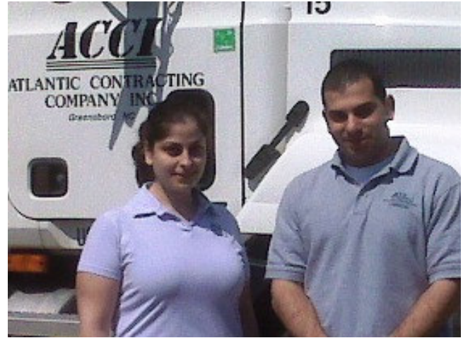
Atlantic Contracting Company has successfully bid on and won NCDOT contracts valued at more than $500,000 as part of ARRA.

Since the first set of stimulus projects in March, DBE firms have won more than $18 million in contracts on